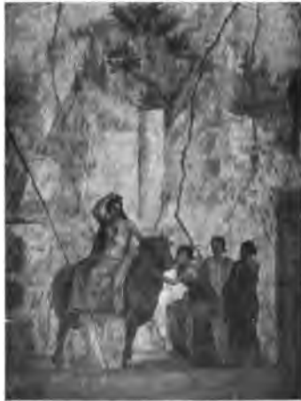
Fig. 72. Europa on the Bull.

Europa. 31 EU RO'PA, the daughter of the Phœnician king, with her friends and companions was one day